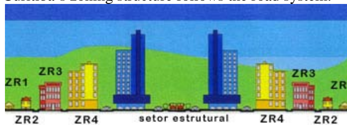
Figure 3: Curitiba's zoning structure follows the road system.