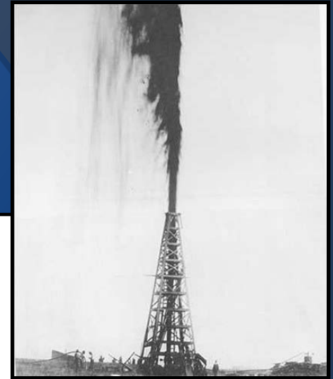
Spindletop Oil Field