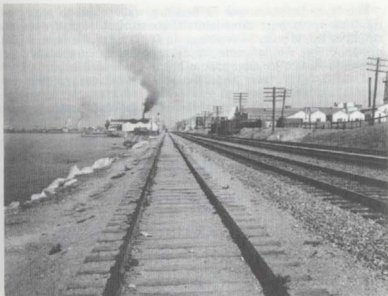
The industrial district on the Berkeley waterfront, early 1900s, from which Berkeley's zoning law sought to exclude residents.